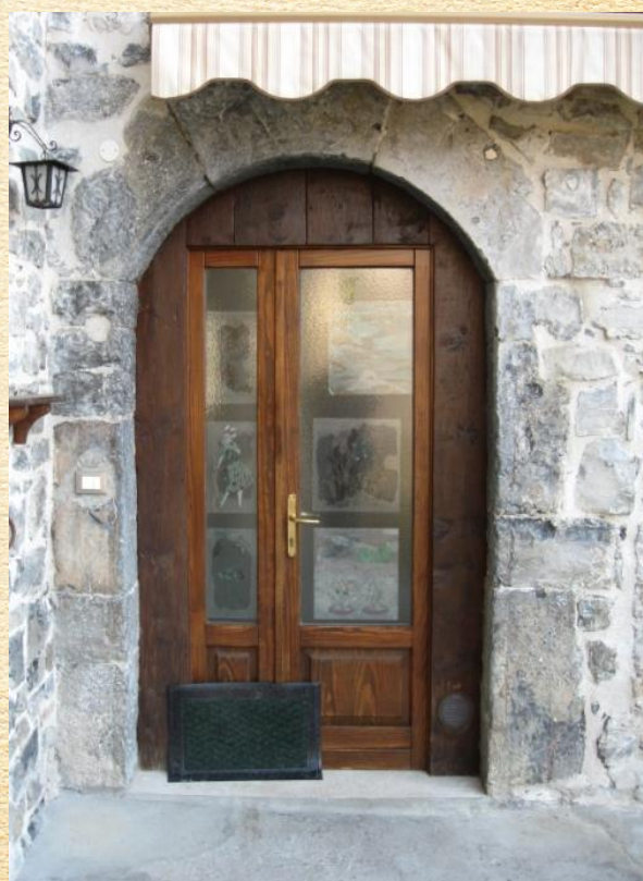
Portal of the XII, XIII century