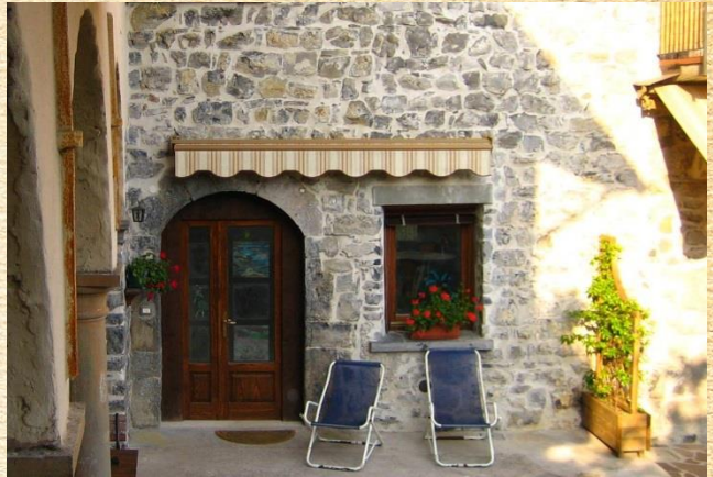
Detail of the west facade, before and after the renovation, the facade is today the Terra apartment