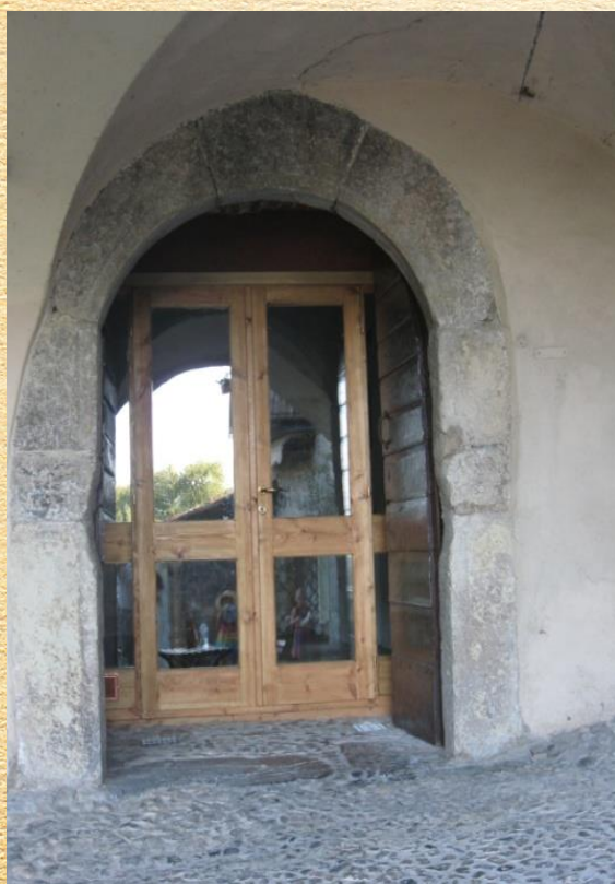
Portal of the XII, XIII century

The castles between the 9th and 12th centuries, more than residences, were fortified villages defended with a set of ditches, barriers of soil, hedges and wooden palisades, with a building also made of materials Poor (wood, straw, etc.)